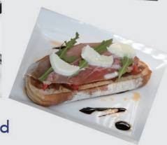
A selection of bread and bruschetta